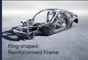
Ring-shaped Reinforcement Frame

With the latest in collision protection and core technologies, Subaru continues its 'people first' policy by improving All-Around Safety and envisions an accident-free future.