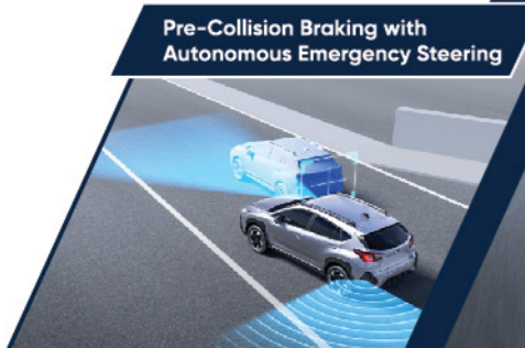
Pre-Collision Braking with Autonomous Emergency Steering