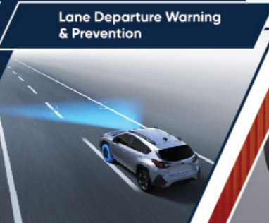
Lane Departure Warning & Prevention