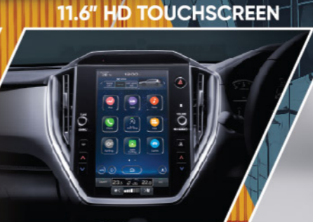
11.6" HD TOUCHSCREEN