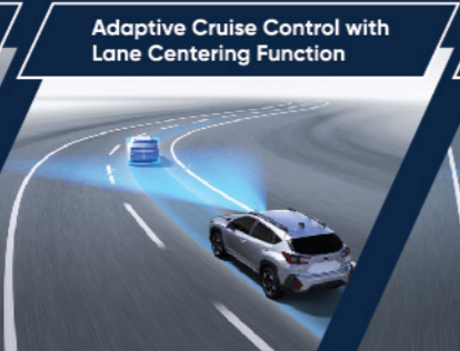
Adaptive Cruise Control with Lane Centering Function