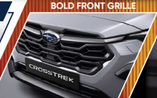
BOLD FRONT GRILLE