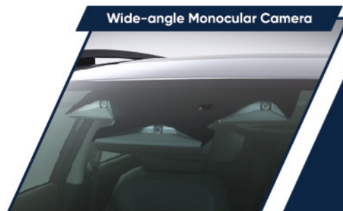
Wide-angle Monocular Camera