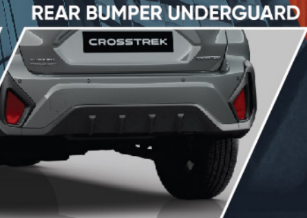
REAR BUMPER UNDERGUARD