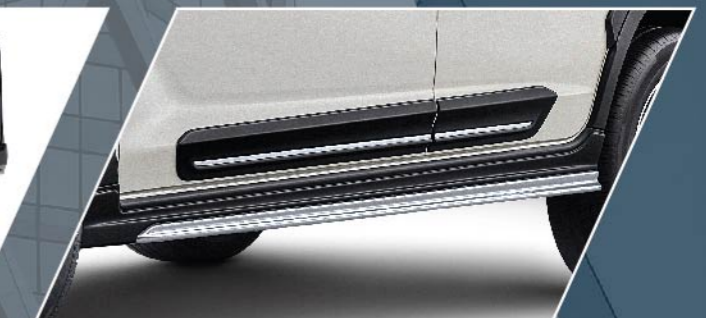
DOOR GARNISH & SIDE UNDER SPOILERS Complements the aggressive, overall stylish appeal