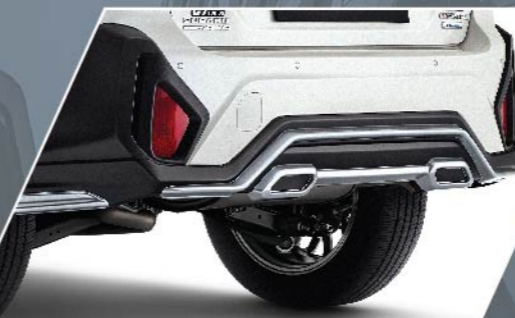
REAR UNDER SPOILER A bolder silhouette for that lasting impression