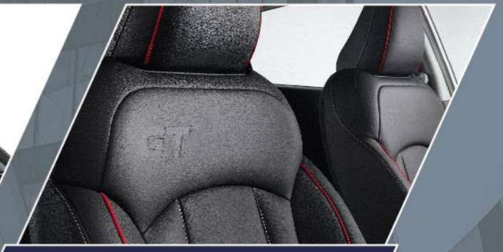
TWO-TONE LEATHER CABIN & EMBOSSED LEATHER SEATS Striking and sporty with contrast stitching, perforation and exclusive branding