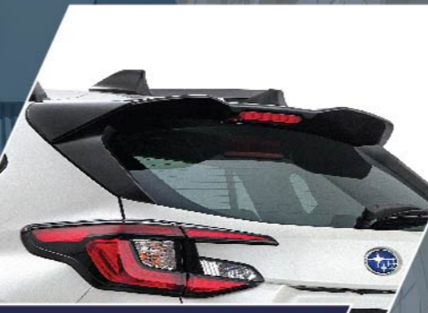
ROOF SPOILER For improved aerodynamics and handling due to more effective downforce