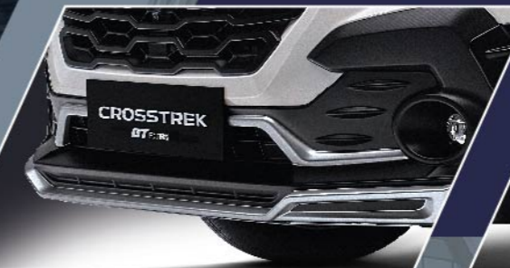
FRONT UNDER SPOILER Gives an imposing, yet sleek look upfront

The Crosstrek GT Edition is the epitome of style and functionality. With the distinctive GT Kit, this isn't just your ride - it's your perfect escape partner! Buckle up and conquer the road like never before!