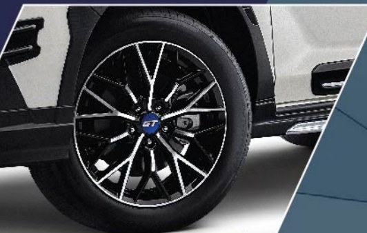
18" ALLOY WHEELS Exclusively manufactured to give a more robust look